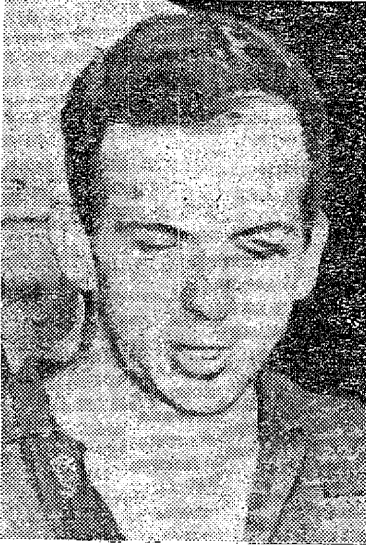
Lee Harvey Oswald: He was not alone, says House panel.