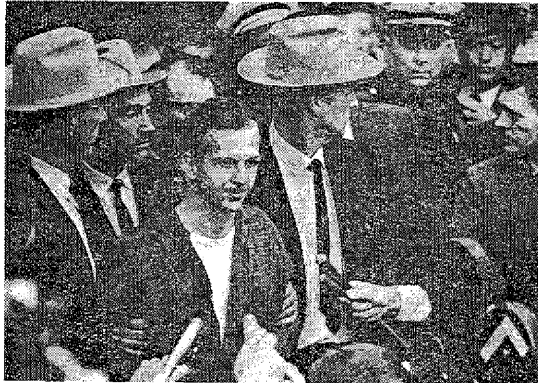
KENNEDY'S ASSASSIN, Lee Harvey Oswald, is flanked by Dallas police after being arrested for killing President John F. Kennedy.

link to three other figures in the JFK assassination is traced to her.