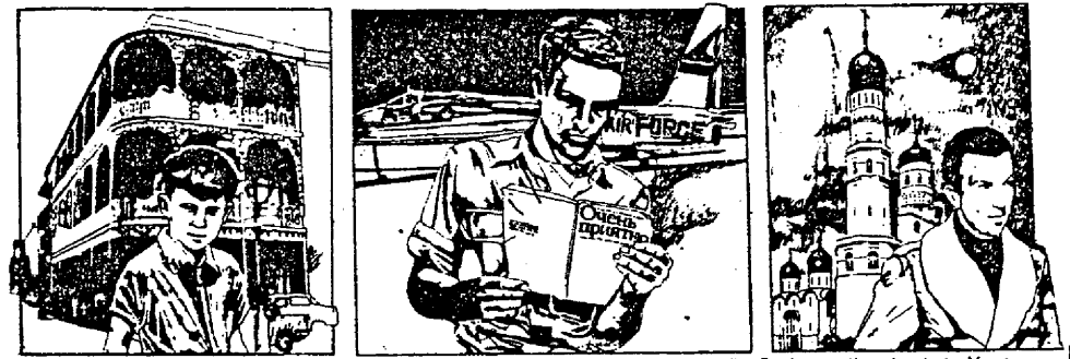
Oswald, the orphanage boy from New Orleans, joins the U.S. Marines, studies Russian — then defects to Moscow . . .

LEE HARVEY OSWALD has gone down in history as a lone, half-crazed sniper who assassinated John Fitzgerald Kennedy, President of the USA, in Dallas fourteen years ago. Today, as this investigation shows, the official verdict on the killing is gravely in doubt . . .