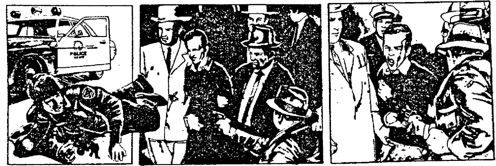
After Kennedy assassination, a police patrol man is killed. Oswald is arrested—only to be shot by Jack Ruby . . .