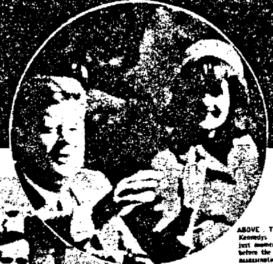
ABOVE: The Kennedy's first assassin before the assassination.