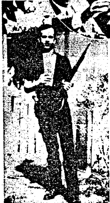
Lee Harvey Oswald posing with a rifle.

The riddle they didn't even try to solve