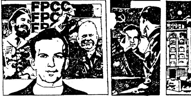
... back in U.S. he campaigns about Cuba, secretly meets top Russian, then arrives at Dallas.