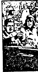
11.50 . . . The motorcade rolls.