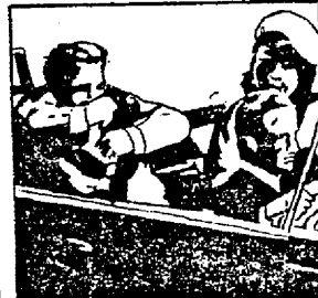
12.30 The President is hit. He jerks backwards and slumps. Jacqueline reaches out to her dying husband.