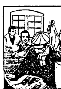
Meanwhile, where is Oswald? His exact location is uncertain. But he is seen leaving work at 12.32.

Formed through the amalgamation of the Glass, Insulation Glazing, Heavy Glazing and Glass Products Associations.