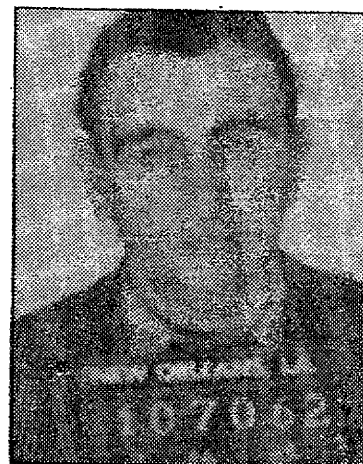
DAVID FERRIE died mysteriously, as he said he would. He also worked for the CIA.