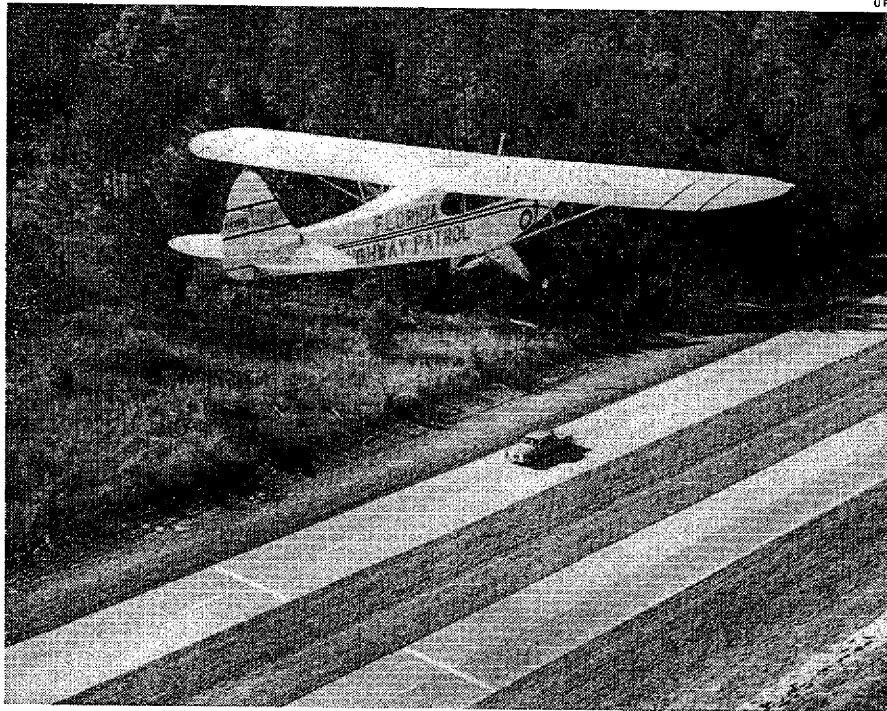
FLYING TROOPER HUNTING SPEEDERS Shot down by legal flak.

The prima-facie technique has been adopted by legislatures or courts in many of the 45 states where police now use radar. Joining four other states,