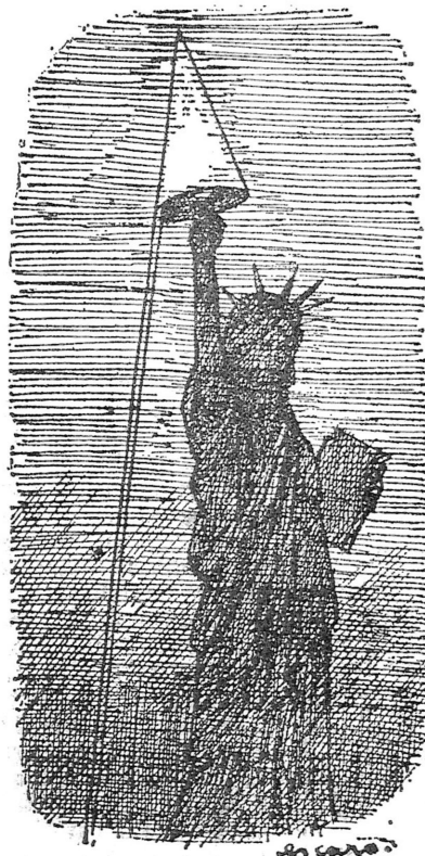
es caro in Humanite, Paris

not likely to have been perceptible from a source high up and inside a building. She noticed the odor after all the shots were fired and therefore possibly when [her] car was turning down hill into Elm St., approaching the knoll." The author also quoted Sen. Ralph Yarborough, in an article soon after the assassination, as stating that "he smelled gunpowder as the car drove away through the underpass." Rep. Ray Roberts, riding in the