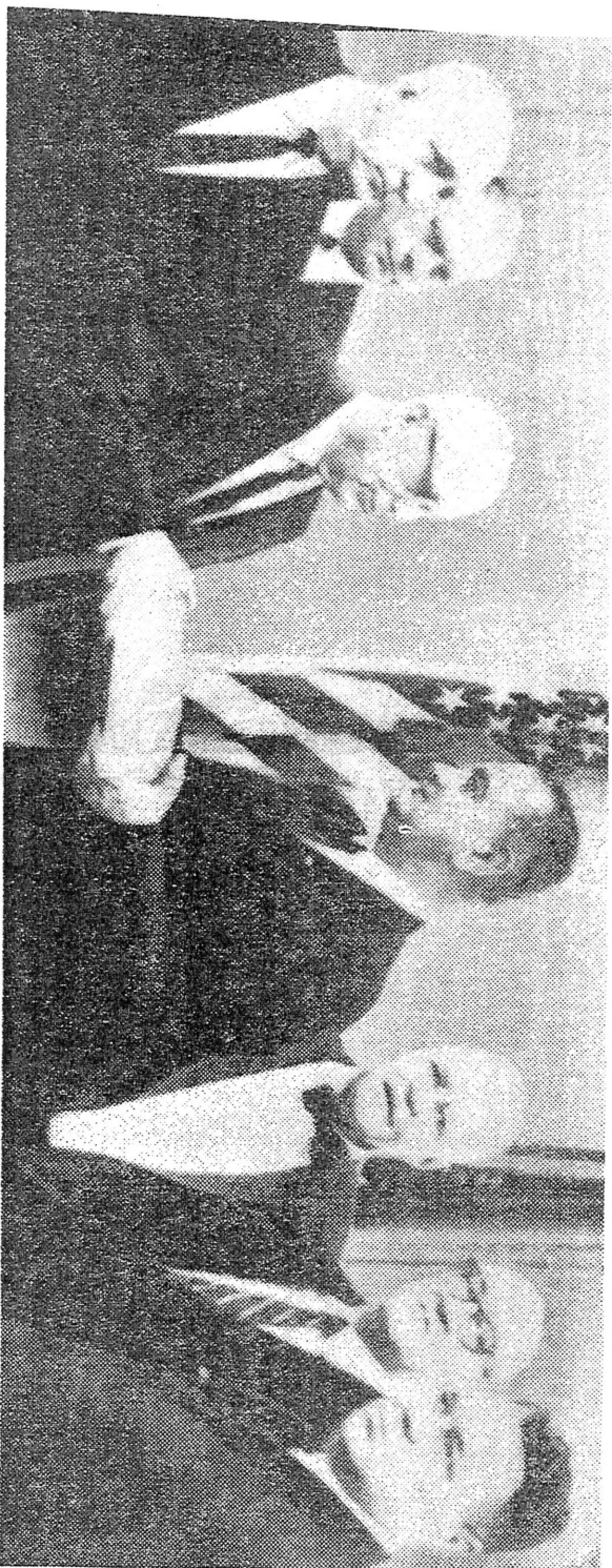
Chief Justice Warren, with members of his Commission, hands over the Report to President Johnson

THE WARDEN OF ALL SOULS CONSIDERS LAST WEEK'S 'ASTONISHING' CRITICISM OF THE WARREN REPORT BY HUGH TREVOR-ROPER