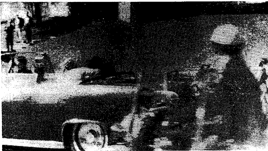
The terrible moments: President Kennedy slumps under assassin's gun