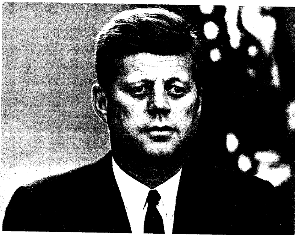
In a betrayal by the CIA, the tactical plan President John F. Kennedy had approved for the Bay of Pigs was sabotaged from the inside.

trol, for the ever-growing size and frequency of “covert” operations. Of course in this context the whole idea of “covert,” “clandestine,” or “secret” operations becomes ridiculous. Such operations cannot be kept secret; they are called “secret” as a means of disciplining the media and any possible whistleblowers.