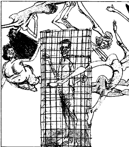
[Page 36] The Secret Circus