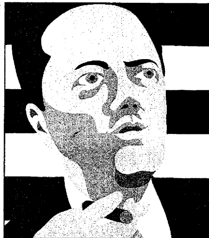
[Page 17] The Garrison Thesis