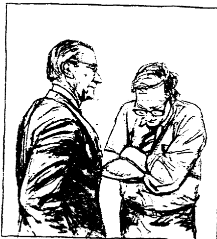
Colby with Seymour Hersh of The Times .

I felt I owed Hersh the interview he requested and could trust his responsibility.