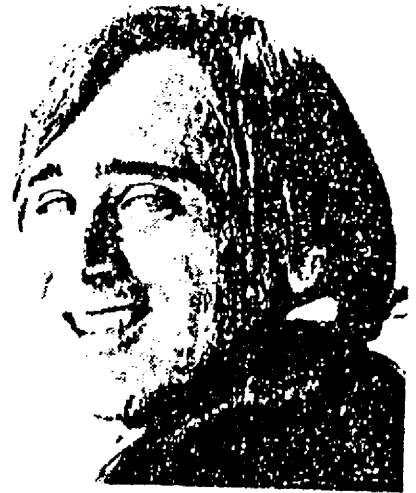
EDWARD JAY EPSTEIN

He said it was a "possibility," however, that "some hothead" in the Cuban Embassy in Mexico City suggested to Oswald in early October, 1963, that he "do some act" and that Oswald then de-