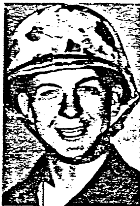
Marine Oswald in 1958

hours at the Queen Bee, one of Tokyo's three most expensive nightclubs and a suspected hangout for intelligence agents from various nations. Even though dates there cost up to $100 a night and Oswald took home less pay than that in a month, he began appearing at Atsugi with one of the Queen Bee's prettiest hostesses. When he was assigned temporarily to Iwakuni, a U.S. airbase 430 miles from Tokyo, Oswald was seen with an attractive Eurasian woman. "She was much too good-looking for