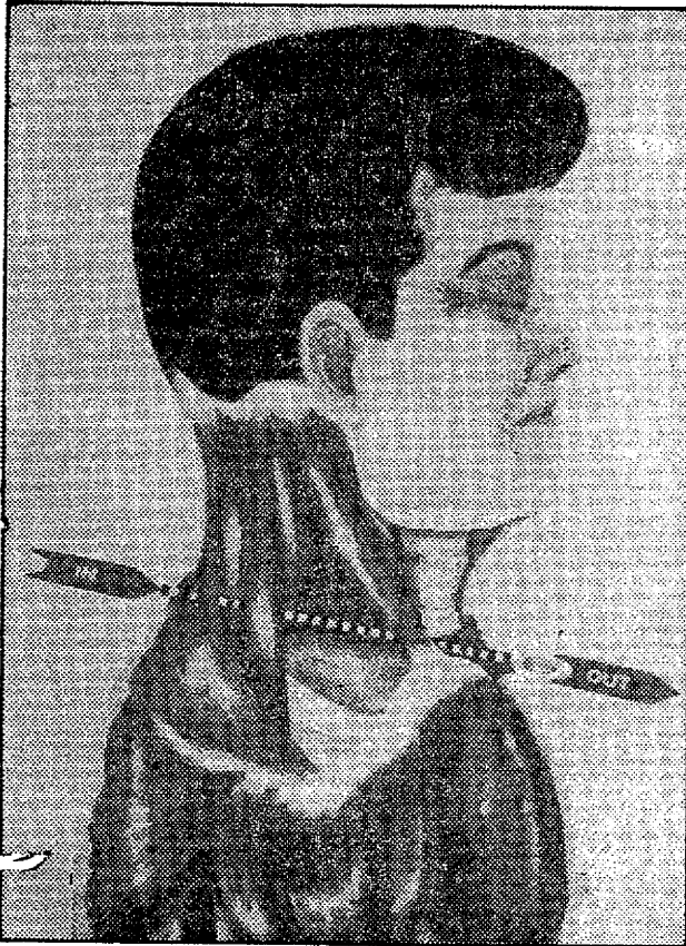
The Warren Commission Report