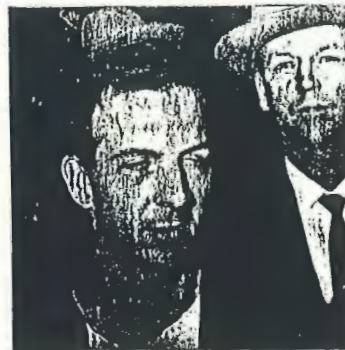
GARY OLDMAN AS LEE HARVEY OSWALD