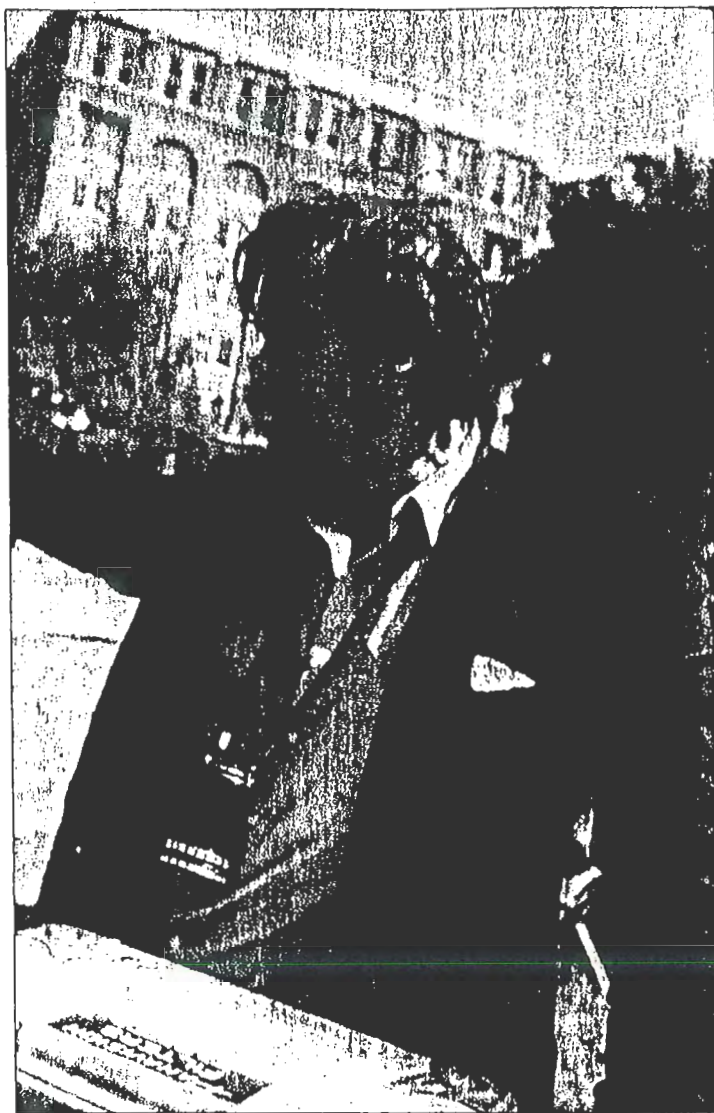
OLIVER STONE IN THE SHADOW OF THE SCHOOL BOOK DEPOSITORY BUILDING: CAN A FILM CHANGE HISTORY?

what his government told him. Thus, Stone had no interest when, in late February 1967, a man who would one day play a major role in his life and in his art stepped before a bank of microphones to make a startling announcement. He had found the answers. He had solved the case.