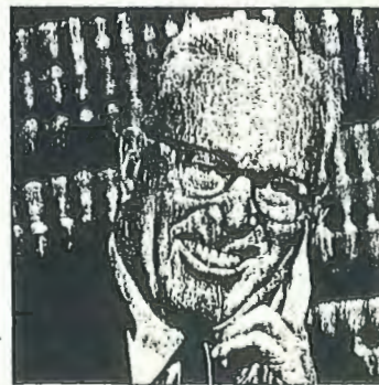
JIM GARRISON AS EARL WARREN

ly converged on the scene. There, after a brief struggle and a shout from one of the officers—"Kill the President, will you?!"—Lee Harvey Os- wald was arrested.