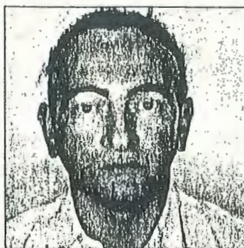
JOE PESCI AS DAVID FERRIE