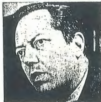
KEVIN COSTNER AS JIM GARRISON