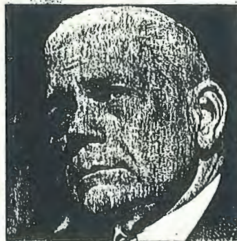
TOMMY LEE JONES AS CLAY SHAW