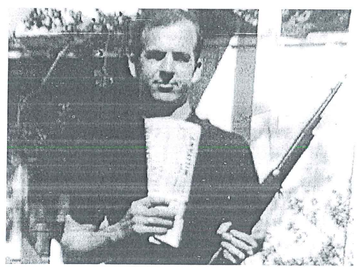
Lee Harvey Oswald framed for the assassination of JFK, where this photo was part of the operation. See Jim Fetzer and Jim Marrs, "The Dartmouth JFK-Photo Fiasco" (google).

Mantik, moreover, studied the autopsy X-rays using the method of optical densitometry to determine the relative density of the objects whose exposure to X-rays had created the images [43]. He found an area at the back of the head that had been "patched" using material that was too dense to be human bone and that a 6.5mm metallic slice had been added to other X-rays in an apparent effort to connect the shooting with an obscure Italian weapon Lee Oswald was alleged to have used.