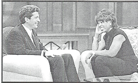
NEWSWORLD SHOWDOWN Copyright © 2007

[ Shop | Travel | Leadership | Justice | Law | Tribute | Nixon | Kafka | JFK | Links ]