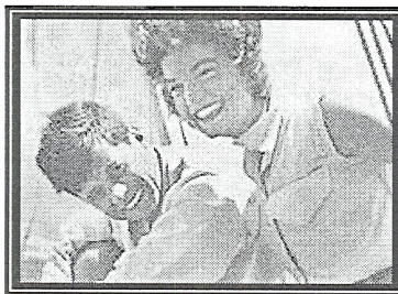
NEWSWORLD SHOWDOWN Copyright © 2007