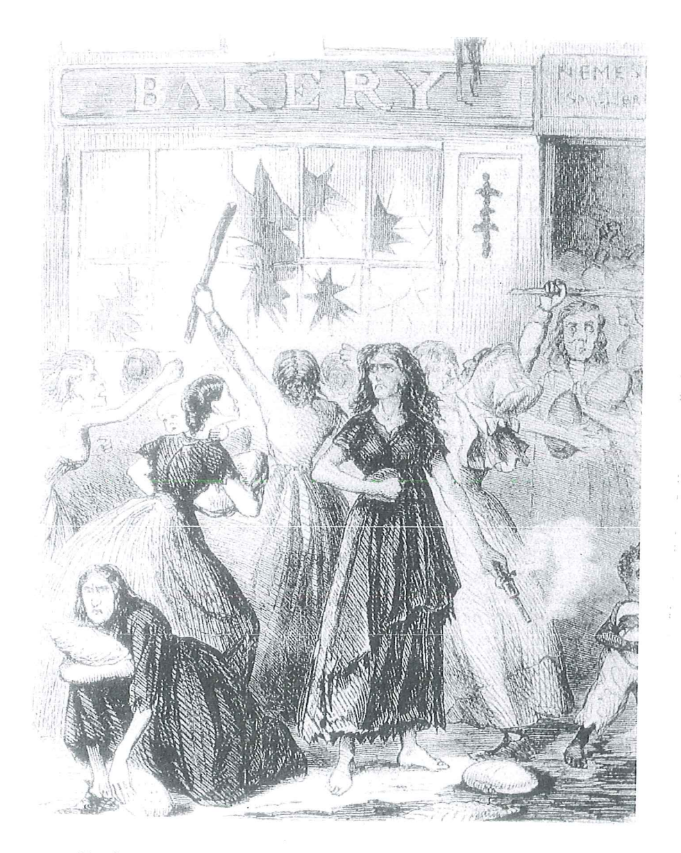
"Southern Women Feeling the Effects of Rebellion and Creating Bread Riots" — Frank Leslie's Illustrated Newspaper.