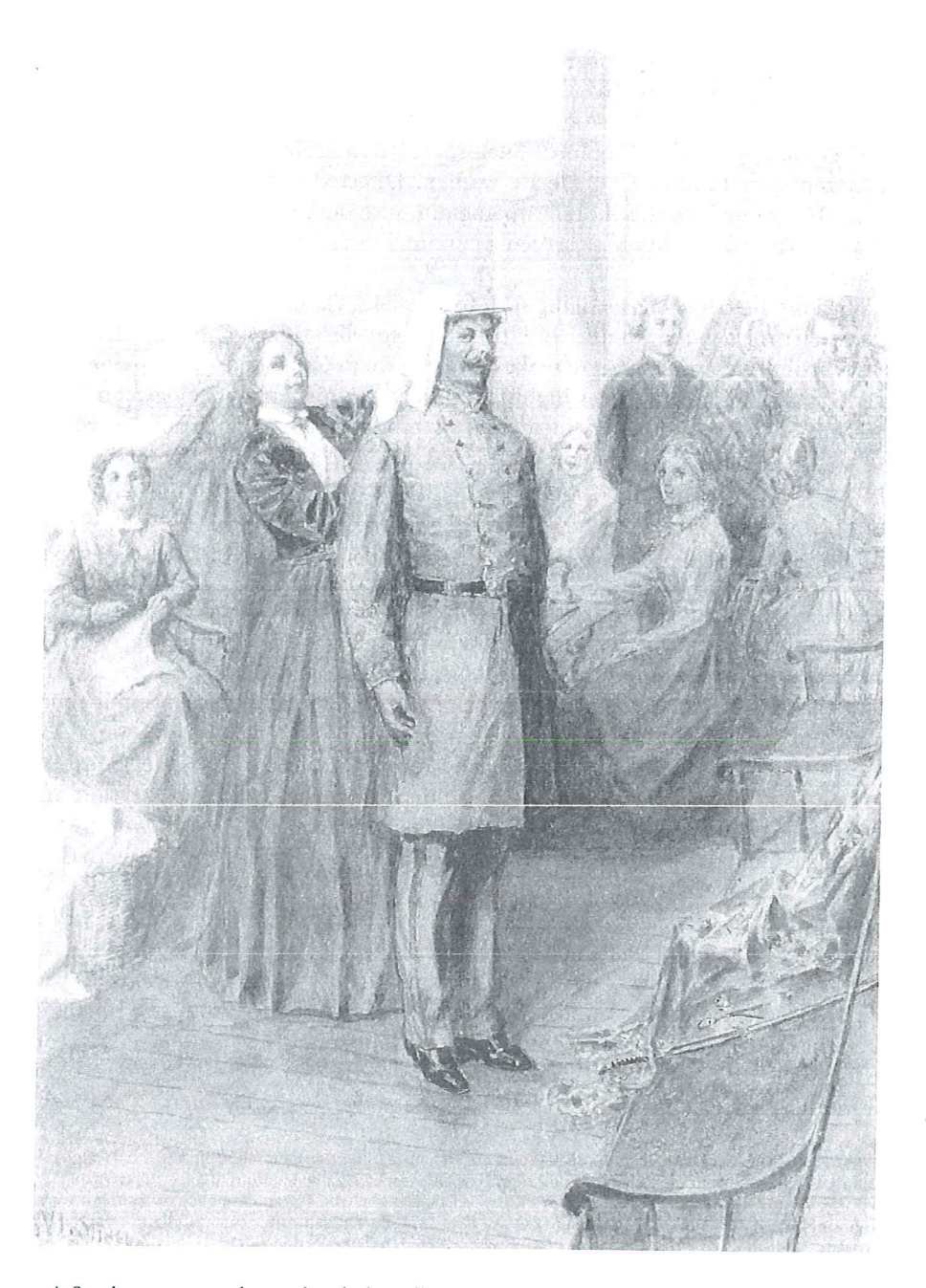
A Southern woman places a havelock-a linen cap popular during the early months of the war-on a Confederate soldier. Watercolor entitled Equipment by Confederate veteran William Ludwell Sheppard.