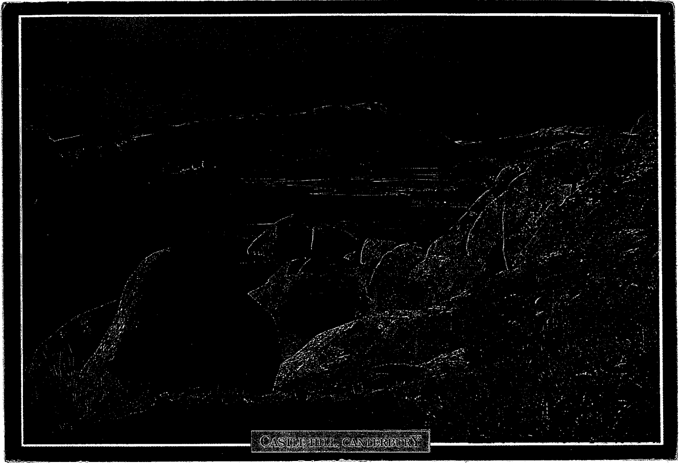
CASTLE HILL CANTERBURY