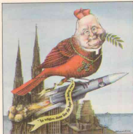
[Page 2] Sorel's Bestiary