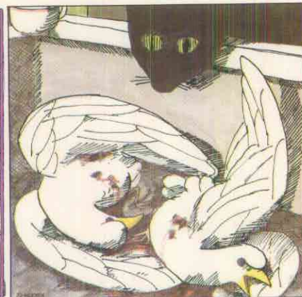
[Page 51] Blood on the Doves