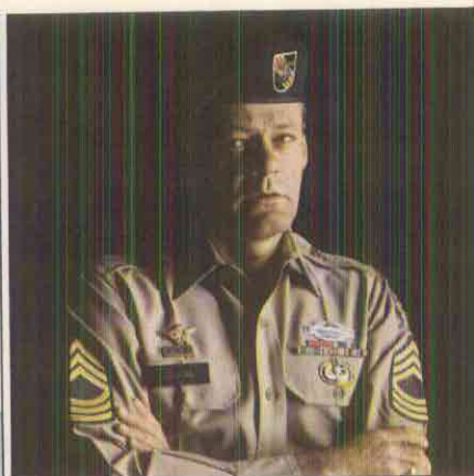
[Page 12] "I Quit!"