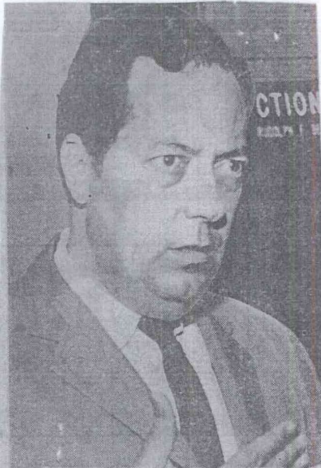
DISTRICT ATTORNEY JIM GARRISON