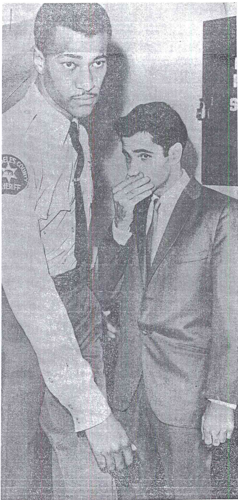
LEADING THE WAY —A deputy sheriff who towers over the slightly built Sir-hen walks ahead as the defendant is led to courtroom for the first session.