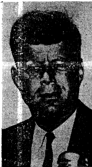
JOHN F. KENNEDY Assassinated President.