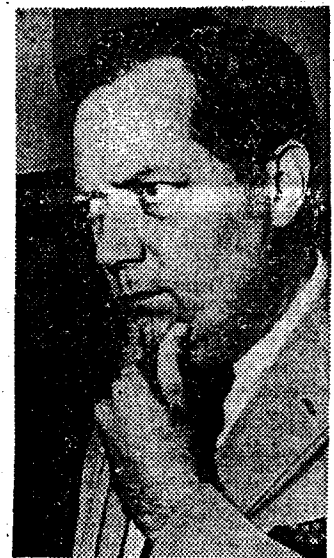
JIM GARRISON Claims death plotted.