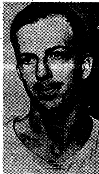
LEE HARVEY OSWALD Named as assassin.