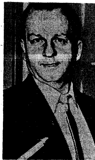
JACK RUBY Shot alleged assassin.