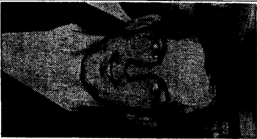
Lee Harvey Oswald