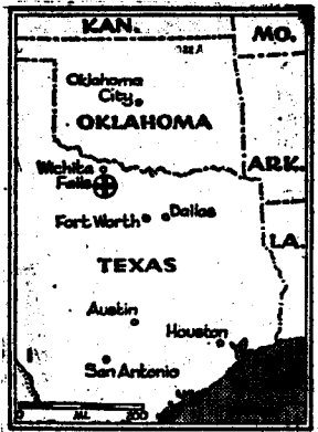
The New York Times Dec. 7, 1966 Cross marks Wichita Falls.