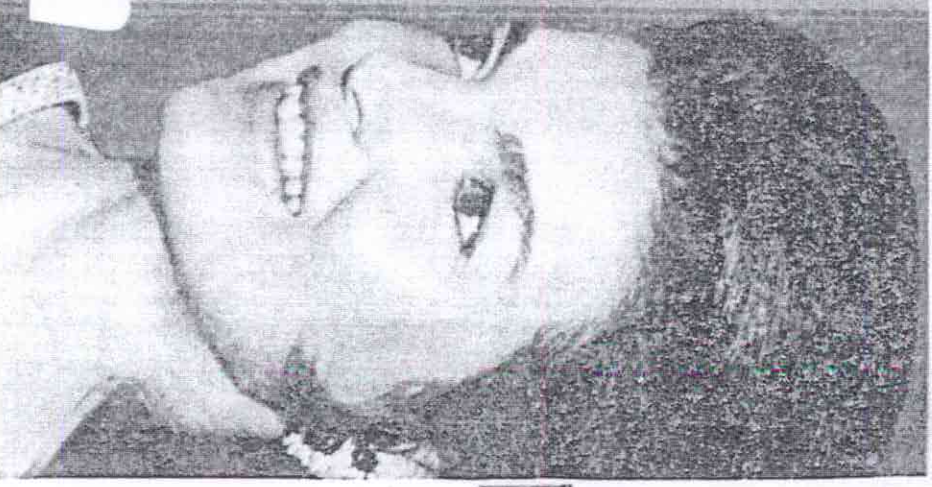
UNHAPPY PREMONITION: Just 3 months before the assassination of Senator Robert F. Kennedy (left), Jackie Kennedy told Gian-Carlo Menotti she had a strange feeling that brother-in-law Bobby would meet with the same fate as her husband.