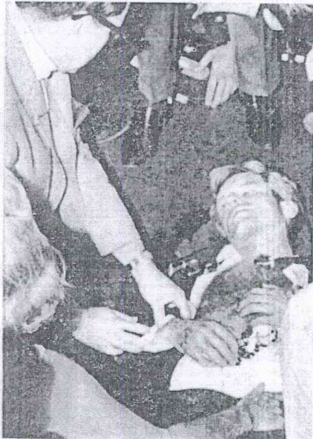
RFK KILLING: Fatally wounded with a bullet in his brain, Senator Kennedy clutches Rosary beads. His wife's arm and part of her head can be seen at lower left of the photo.