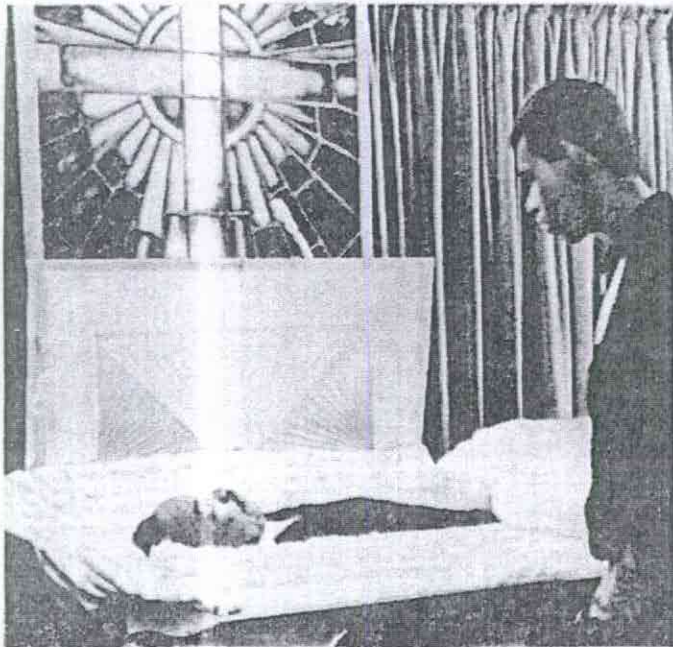
DEAD LEADER: Dr. Martin Luther King's body lies in a Memphis, Tenn., funeral home after slaying.

In an Associated Press story that came out of the city of Los Angeles