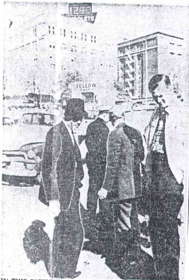
IN THIS PICTURE, Garrison said the official has observed the photographer and has turned away, but can be seen clutching the bullet in his hand. The sign-clock on top of the Texas School Book Depository in background reads 12:40, 10 minutes after the President was shot.

(Continued from page 3) his lair in the Sixth Floor of the School Book Depository, a Marxist Communist was crouched. I think, actually, there's some difference between a Marxist and a Communist, but it doesn't really matter in fairy tales, you can make them the same thing. So he's a Marxist-Communist, and he's crouched there, with his Manlicher-Carcano. He fires 3 rapid shots—shots of fantastic marksmanship—as a result, of course, the President is killed and the Governor of Texas is wounded, and, as I know Mark Lane has explained to you at