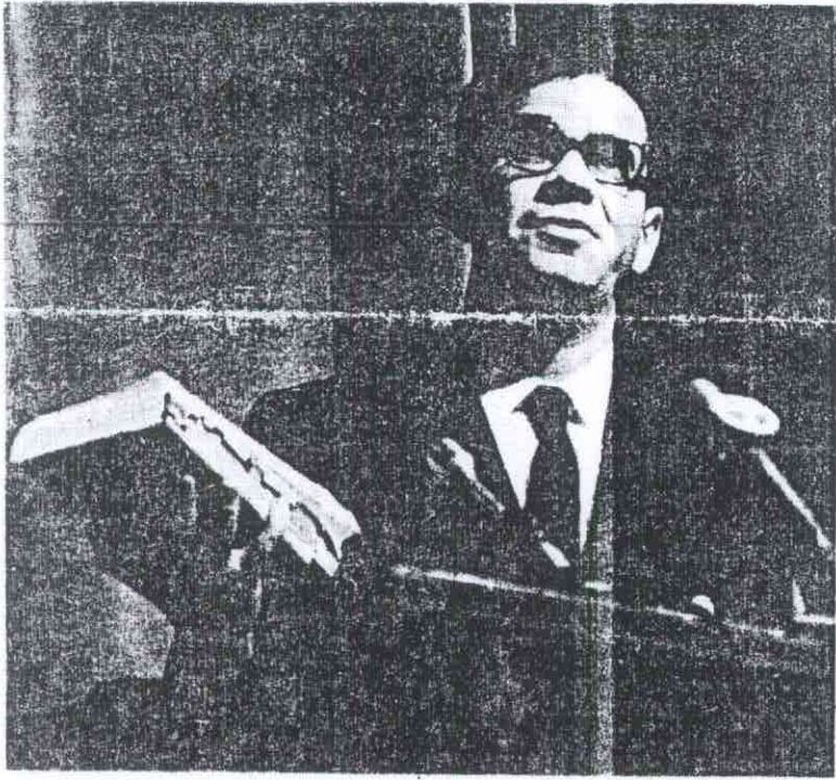
MARK LANE AT BEVERLY HILLS HIGH SCHOOL DEC. 4, 1964

"Ladies and Gentlemen of the Jury --for you are the only jury--the American people--the only jury that Lee Harvey Oswald, shot to death in the basement of an American Courthouse in Dallas while handcuffed to law-enforcement officials, the only jury that he will ever have.