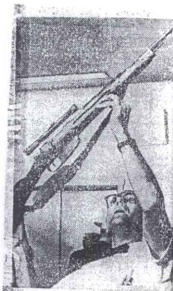
Above: Oswald's rifle.

Maybe also the importance of this book and others like it is slightly exaggerated. Why should the possibility or the probability or even the certainty that there was a second unidentified man working with Oswald be supposed to shake Washington to its foundations or to require for its concealment the invention of a political truth? end