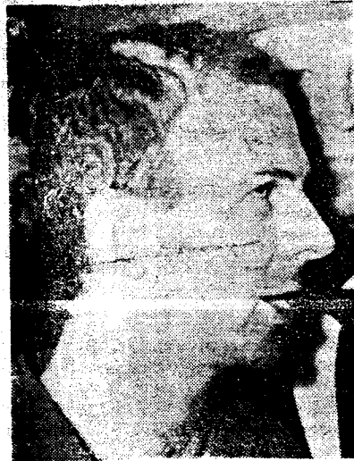
LEE HARVEY OSWALD