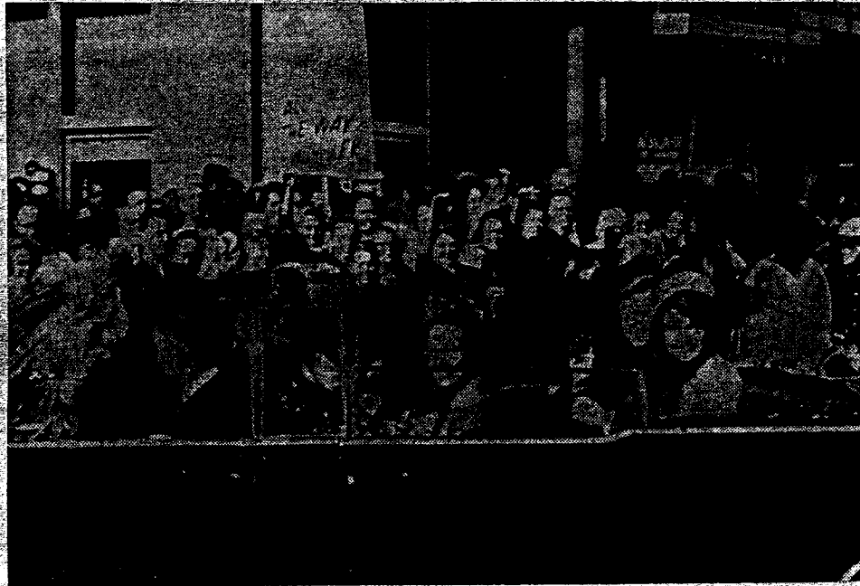
Was Jackie on the trip to lend drama to JFK's staged death?

change his discharge. This is a matter for the Veterans Administration.