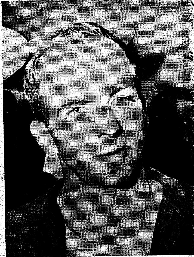
The arrest of Lee Harvey Oswald. "I did not believe he could be guilty."

From the moment I heard that it was Oswald who was