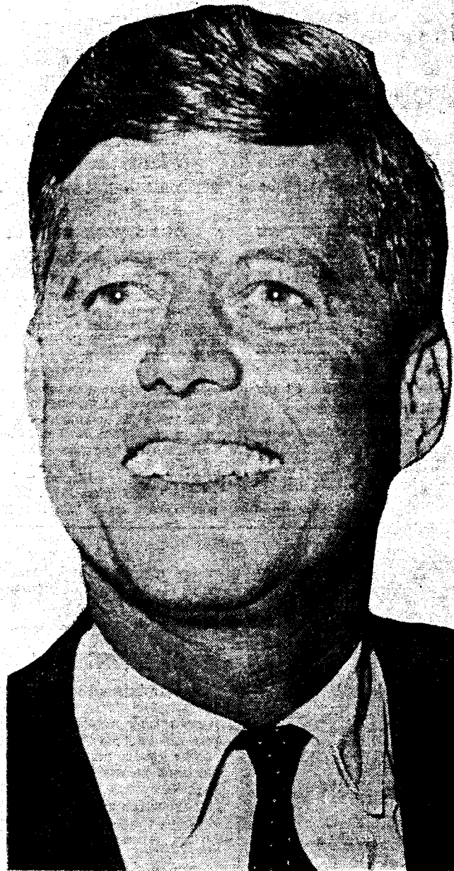
JFK was to become the victim of a man who wanted to find a place for himself in history.

Like many men who are laughed at Lee took refuge in being a comedian. He made jokes at his own expense, per-