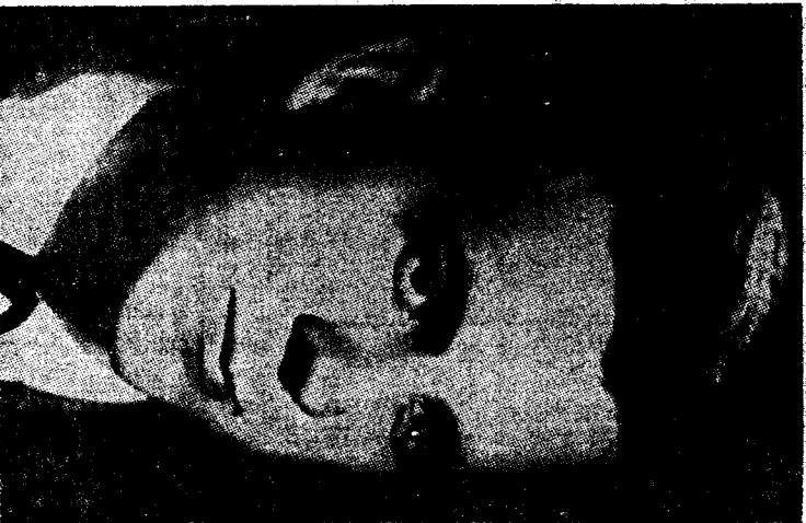
Oswald, a young man concerned about humanity problems.