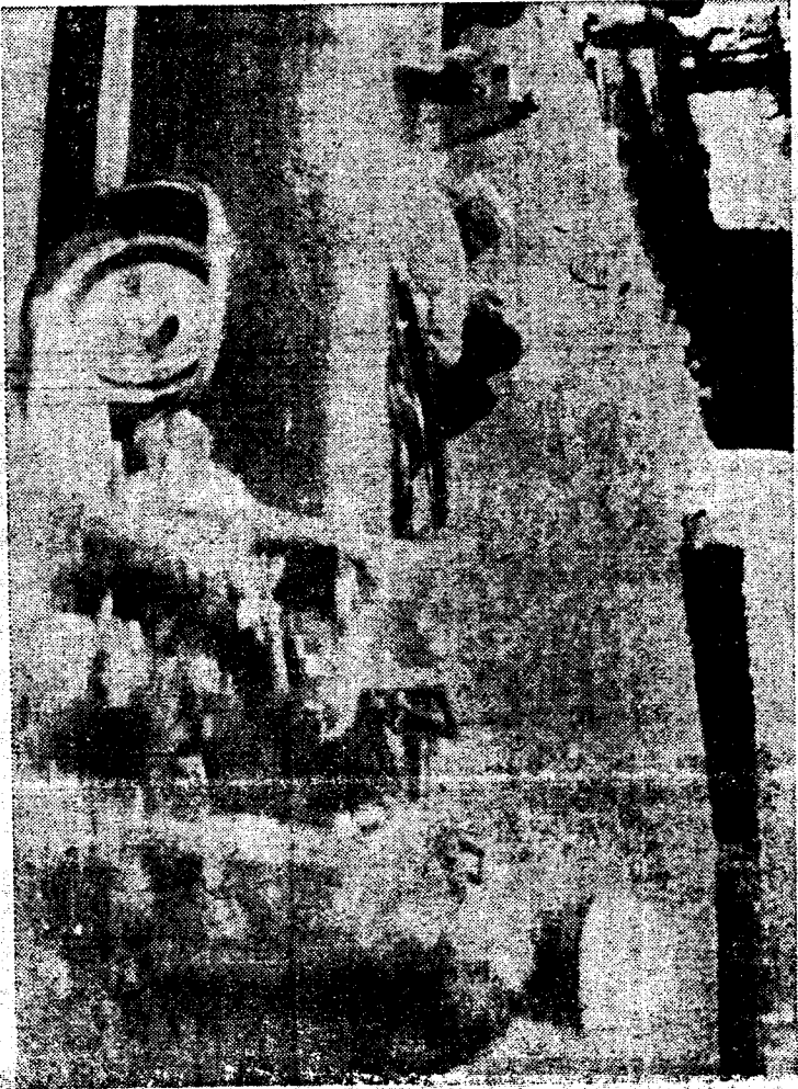
As President Kennedy lay mortally wounded on his wife's shoulder, Lee Harvey Oswald started his escape from the Book Depository.