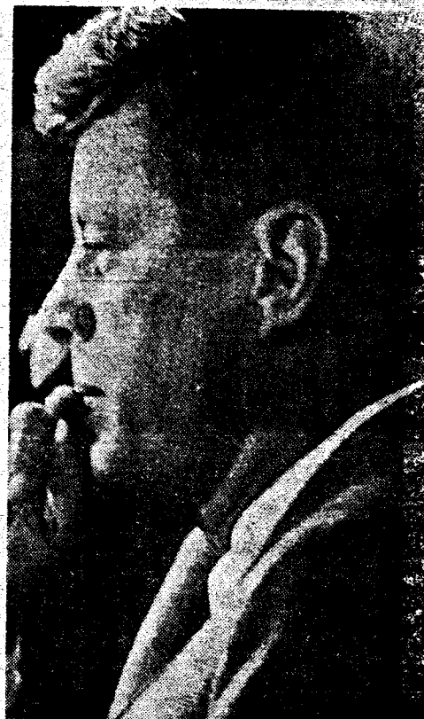
John F. Kennedy as a young Senator.

along in the world, (difficulties) which were usually caused by different factors." But Oswald at this time in his life, was far from despairing.