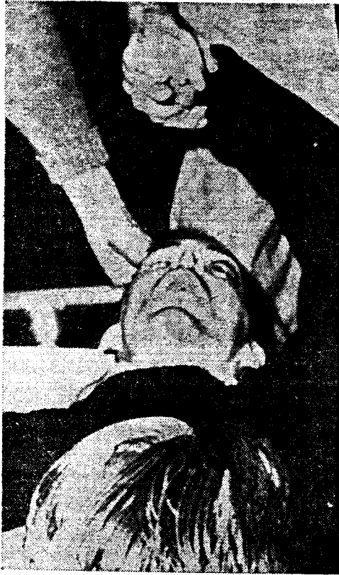
Oswald after he was shot by Jack Ruby.