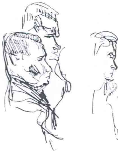
Jurymen watch the trial intently.