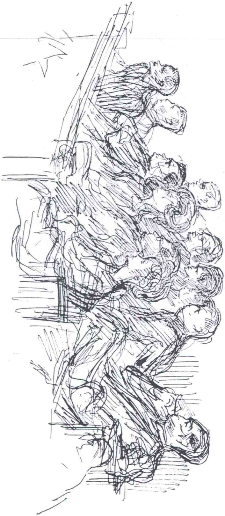
Members of Dallas jury were out only two hours, 19 minutes before coming in with death verdict. Defense team for Ruby has filed appeal.