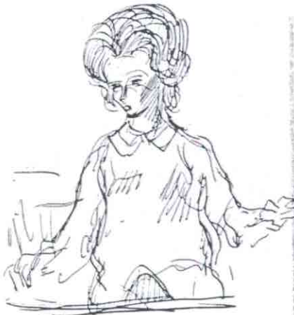
Little Lynn, the pregnant stripper.

jail-office door to the ramp. The driveway is perhaps 30 feet long. There was no plan to walk Oswald down those 30 feet. The plan was to show him to the cameras just long enough to prove that he had not been beaten. The plan went wrong when scurrying reporters and photographers cut off Dohrity.