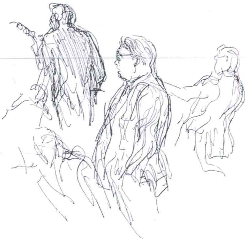
Defense Attorney Mel Belli caught in three characteristic poses.