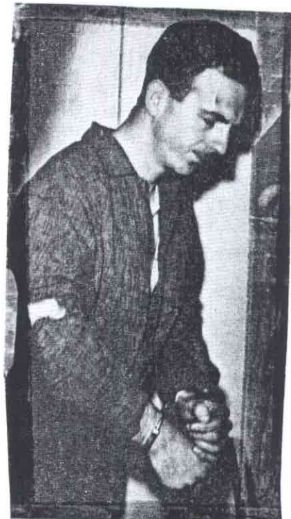
... Dallas Police Station after arrest.

"... What we want is conclusive proof that the man is not Oswald, not just the bland assurance it is Lovelady ... God, I hope it isn't Oswald in the picture. But I want it established beyond any doubt at all ..."