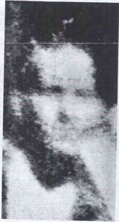
There are limits to even the most sophisticated photo-enlarging techniques. Above left, an unretouched photograph of Lee Oswald the afternoon of his capture. Center, the "man in the doorway" enlarged to about twice the size of the print on page 8. Right, the same print enlarged about eight times its original size.