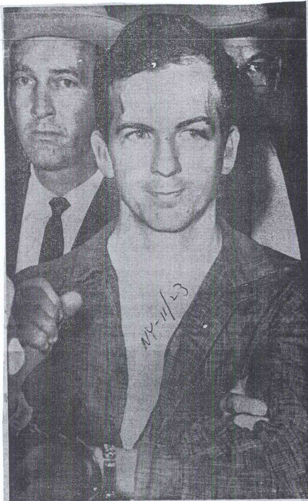
CHARGED WITH ASSASSINATION: Lee H. Oswald, in handcuffs, at police headquarters in Dallas. He was charged by police last night with the murder of President Kennedy.