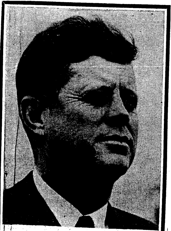
John Fitzgerald Kennedy 1917-1963

The defendant's only comment, shouted at reporters as he was led handcuffed through a police building corridor to be questioned, was "I haven't shot anybody." "He has not con-