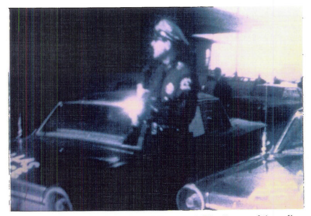
2. Aftermath. Taken on the day of the assassination late that afternoon, of the TSBD.

3. Aftermath. From the intersection of Houston & Elm Street, of the police surrounding the TSBD.