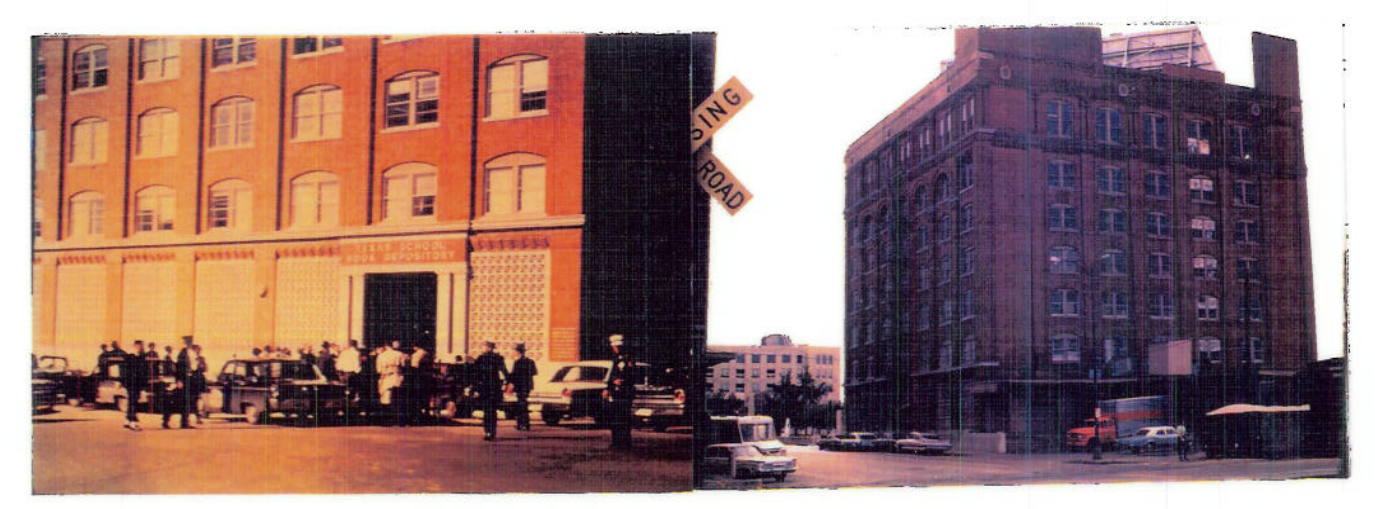
4. Aftermath. Taken from the the intersection of the TSBD.

3. Aftermath. From the intersection of Houston & Elm Street, of the police surrounding the TSBD.