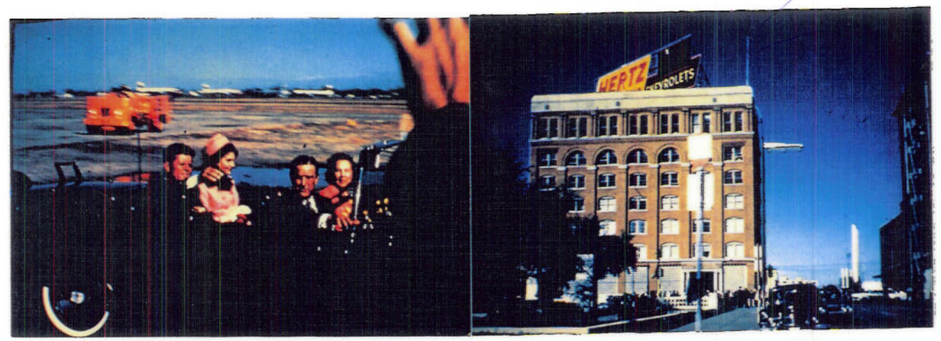
1. Departure. Presidential party leaving Love Field Airport.