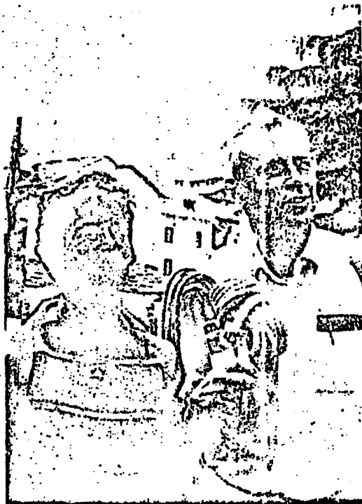
MR. AND MRS. JOHN THUNE 'Freedom is a priceless thing'