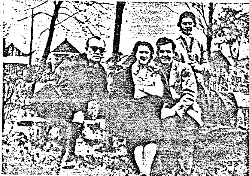
FAMILY OUTING. On a warm day in Minsk in 1962, Lee Oswald and his wife Marina (right) pose in country