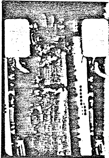
PHOTOGRAPH FROM ZAPRUDER FILM