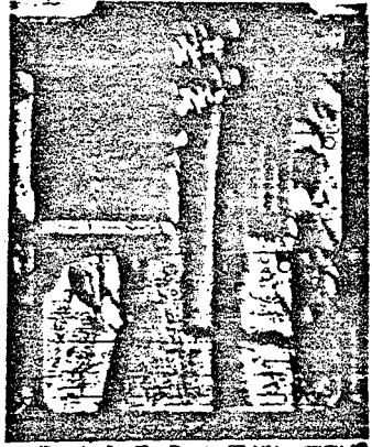
PHOTOGRAPH FROM ZAPRUDER FILM