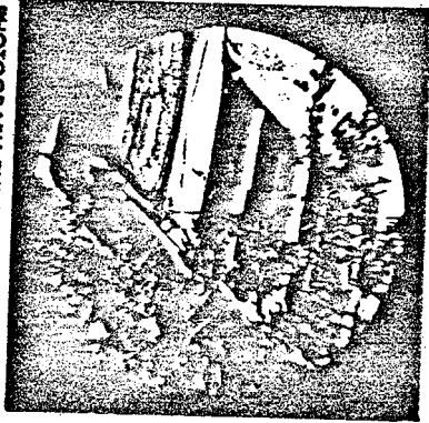
PHOTOGRAPH THROUGH RIFLE SCOPE