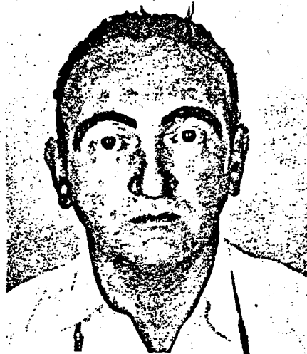
DAVID FERRIE —Found dead in his New Orleans apartment. He had told the press he "supposedly was pegged as a getaway pilot."

The New Orleans D.A.'s attempt to prove that there was a conspiracy to assassinate Kennedy has already involved 100 "witnesses" and "suspects"—and the end is not yet.