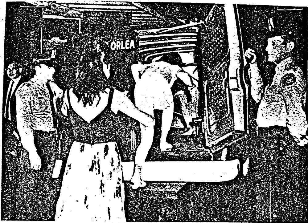
BOURBON STREET SCENE —Roundups of honky-tonk entertainers and headline-making charges of official corruption marked Garrison's district attorneyship before he saw the Warren Report.