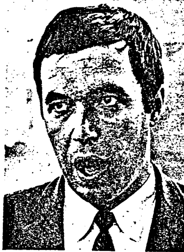
PERRY RUSSO —A star witness for Garrison, who jogged his memory with drugs. He linked Ferrie and Shaw to Oswald.