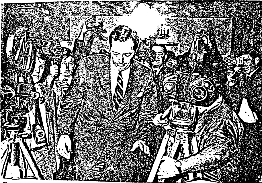
CYNOSURE — Garrison ar- rives for a press conference at a New Orleans motel after his "There-will-be-arrests" statement. "He was surprised by the roomful of newsmen and mumbled something that sounded like 'My God!'"

'Gee! I got something,' a cab driver said the other day. 'At least he better have, or he'll be run out of town.' 99