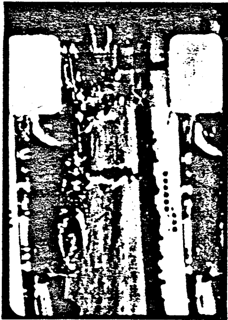
PHOTOGRAPH FROM ZAPRUDER FILM