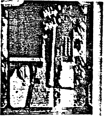
PHOTOGRAPH FROM ZAPRUDER FILM