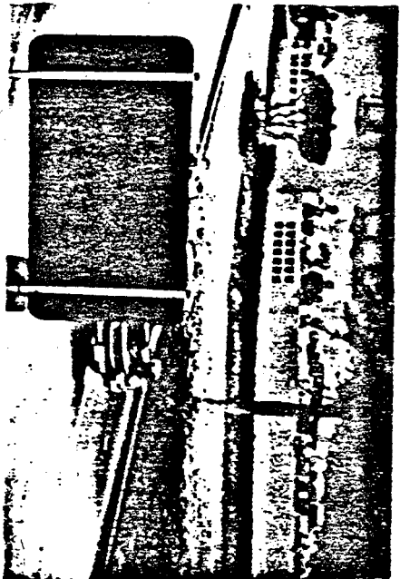
PHOTOGRAPH FROM RE-ENACTMENT