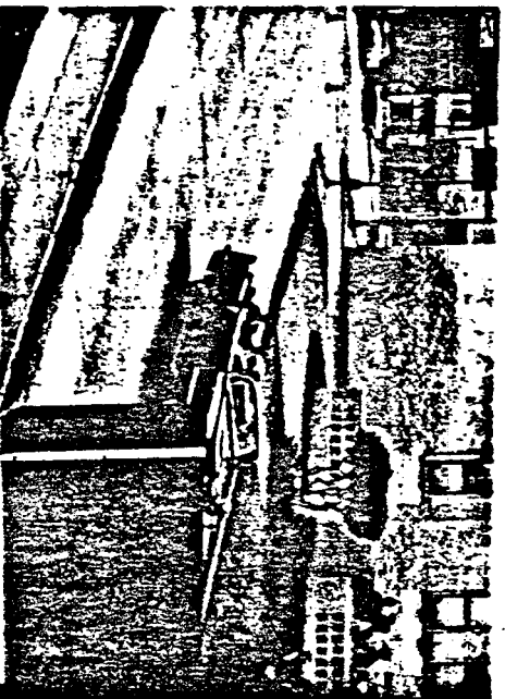
PHOTOGRAPH FROM RE-ENACTMENT