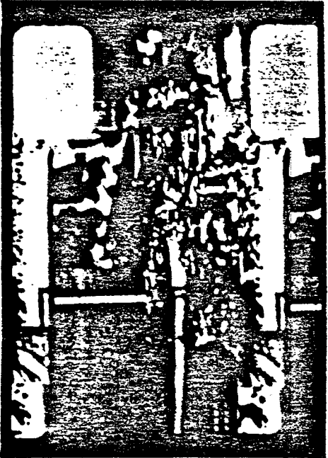
PHOTOGRAPH FROM ZAPRUDER FILM